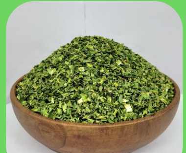
Dehydrated Celery Leaves