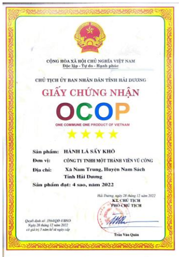
4-STAR OCOP Certification