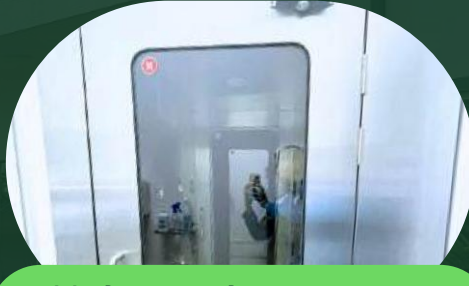
Modern sterilization system ensuring food safety and hygiene