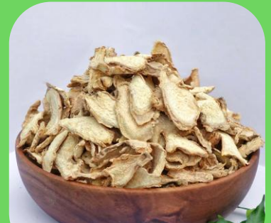
Dehydrated Sliced Ginger