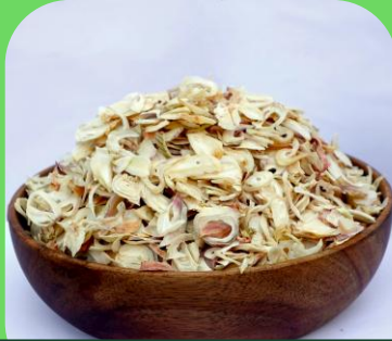
Dehydrated Sliced Vietnamese Onion