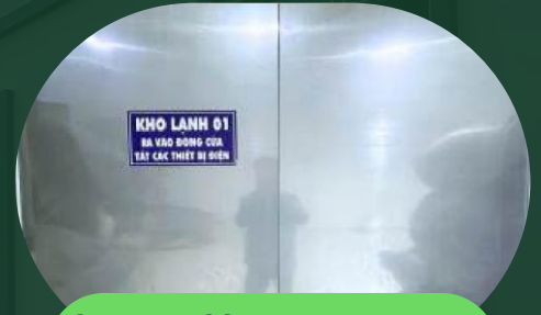
Large cold storage system for product preservation