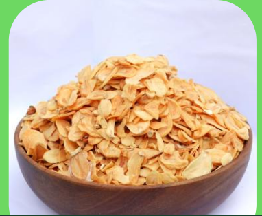
Dehydrated Sliced Garlic