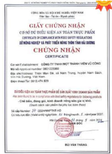
Food Safety Compliant Facility Certification