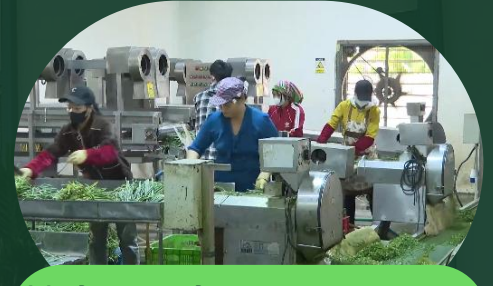
Modern machinery equipment to increase productivity