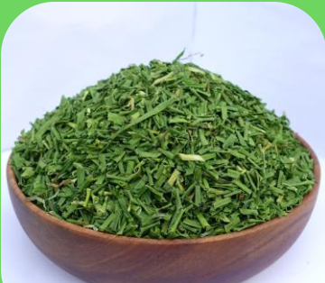
Dehydrated Scallion Leaves