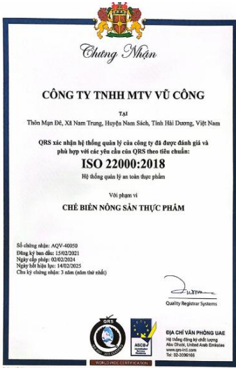
ISO 22000:2018 Certification