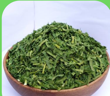
Dehydrated Chive Leaves