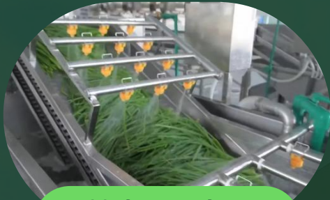
Modern product cleaning process