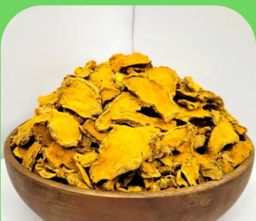
Dehydrated Sliced Turmeric