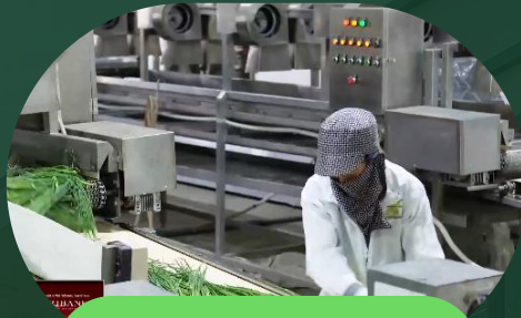
Modern production line