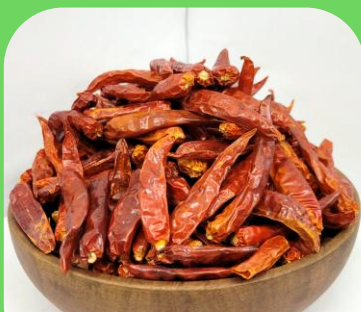
Dehydrated Whole Chili