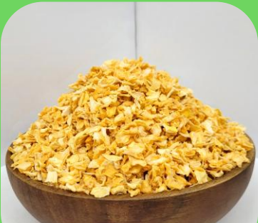
Medium/Well- dehydrated Onion