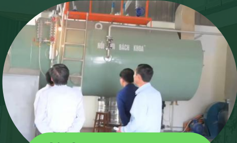
High-capacity steam drying system